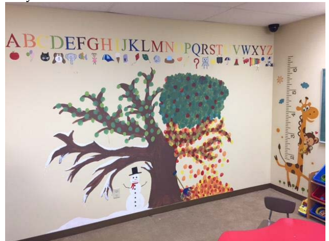
The Learning Mural in the SVdP Child Watch Center

There are many educational benefits that the mural brings to the children who will be spending time there while their parents get the resources that are being offered. Many of these lessons will stem from basic reading, writing, and math skills that provide a strong foundation for children. A big THANK YOU to Mercy College of Health Sciences for all they do at St. Vincent de Paul!